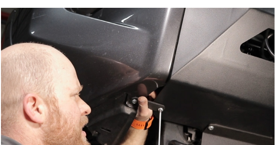
You are now finished with the installation. Enjoy your new Blitz bumper!