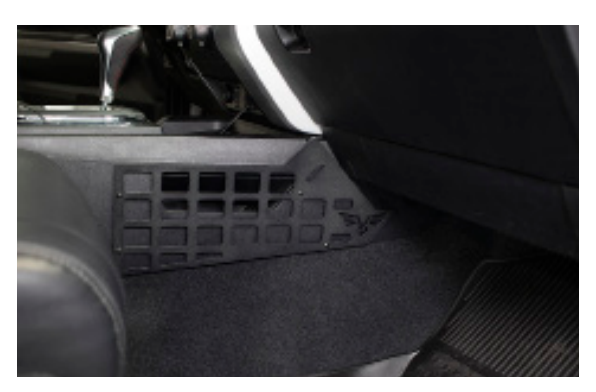
Land Cruiser 100 Series