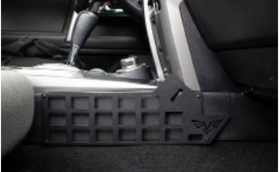
2nd Gen Tacoma